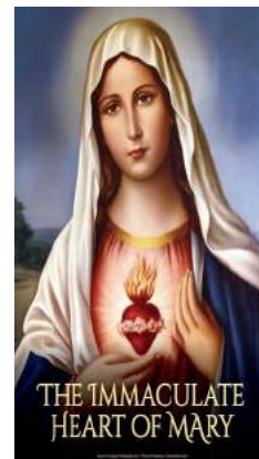
Feast of the Immaculate Heart of Mary— Saturday June 8