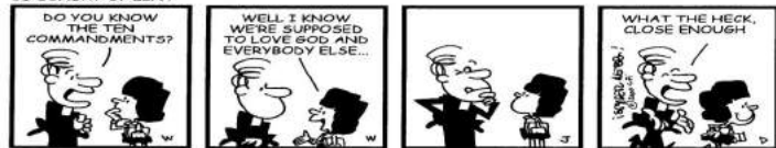
3D SUNDAY OF LENT

THANK YOU to everyone who donated cake mixes, soda, icing, chips, etc to the fish fry! We need NO more donations. Your generosity is appreciated. May God bless you.